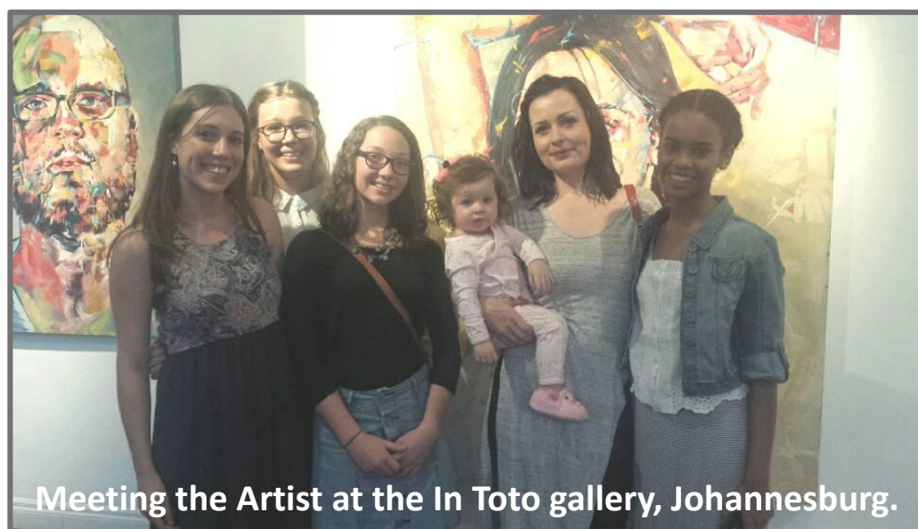
Meeting the Artist at the In Toto gallery, Johannesburg.