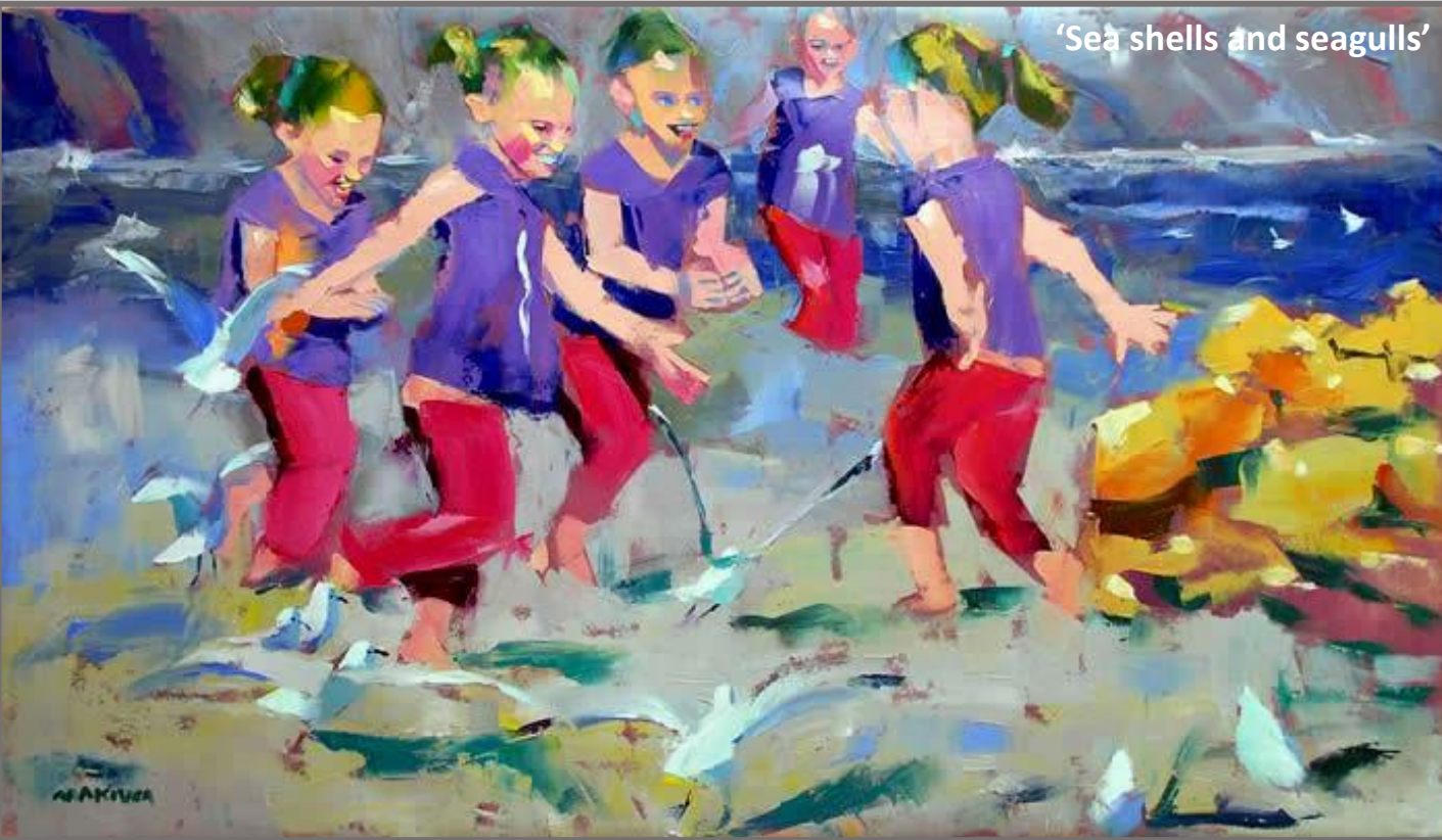
'Sea shells and seagulls'

http://www.makiwamutomba.com/artwork-portfolio/makiwas-letters