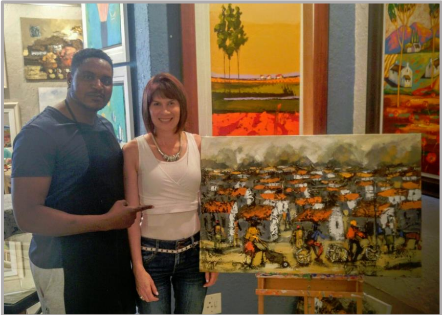
I had the privilege of meeting the artist at Alice's Art Gallery in November 2016.