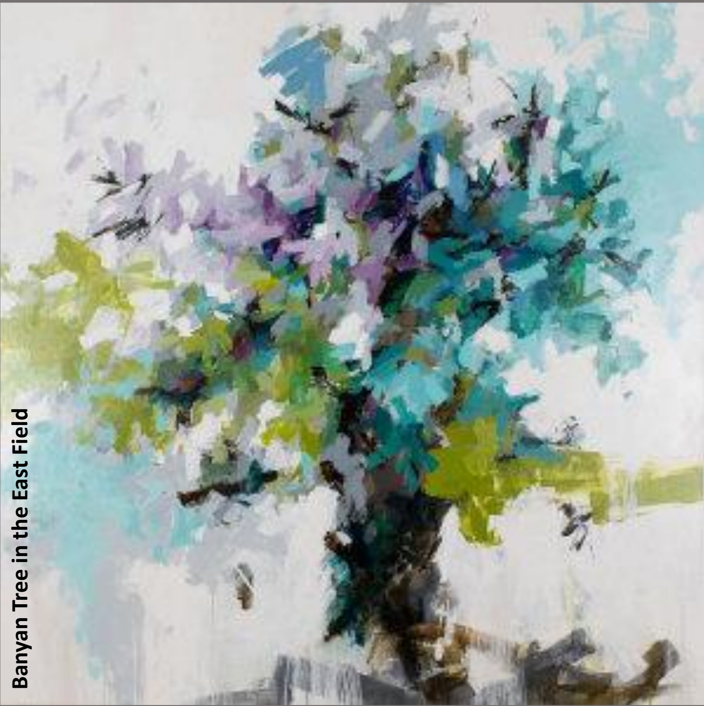
Banyan Tree in the East Field

Carlos paints large abstracts loosely based on nature.