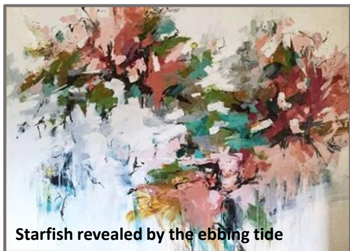
Starfish revealed by the ebbing tide