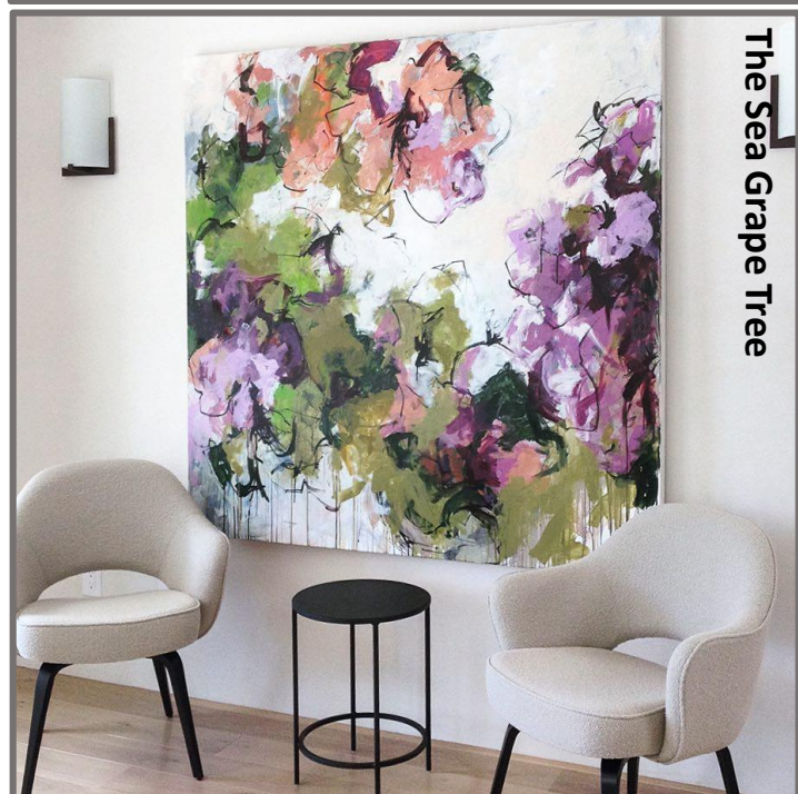
The Sea Grape Tree