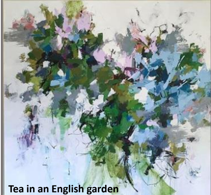
Tea in an English garden